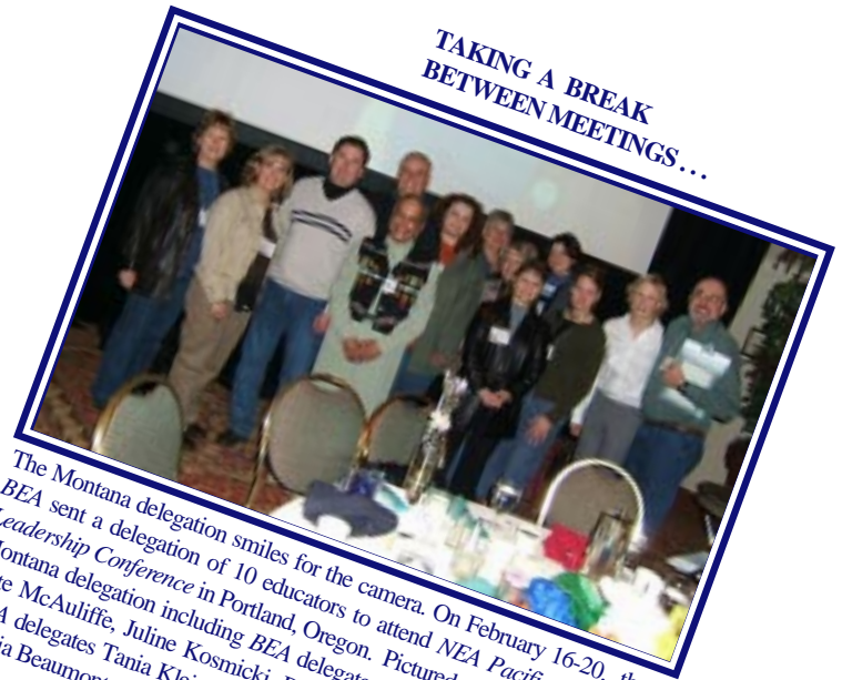
TAKING A BREAK BETWEEN MEETINGS...